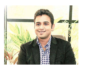
16 startup founders to watch out for in 2016